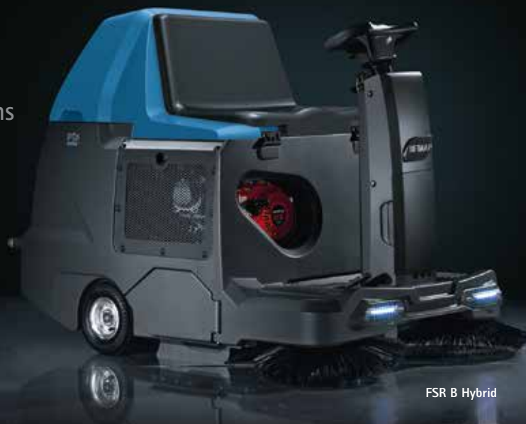
FSR B Hybrid